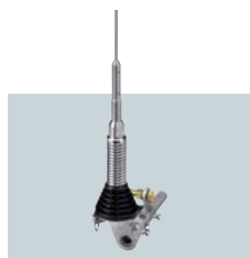
AH-2b ANTENNA ELEMENT For mobile operation with the AH-4. All bands between 7–30 MHz can be matched.