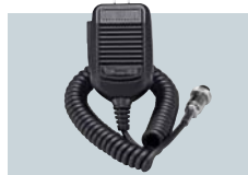
HM-36 HAND MICROPHONE Same as that supplied.