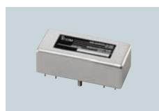
455 kHz FILTERS FL-52A CW/RTTY narrow; 500Hz/–6 dB FL-53A CW narrow; 250Hz/–6 dB FL-222 SSB narrow; 1.8kHz/–6 dB FL-257 SSB wide; 3.3 kHz/–6 dB