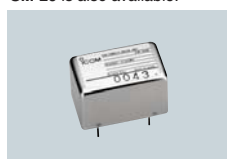
CR-338 HIGH STABILITY CRYSTAL UNIT Contains a temp. compensating heater for improved frequency stability. Frequency stability: ±0.5 ppm