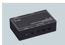
CT-17 CI-V LEVEL CONVERTER For remote transceiver control from a PC equipped with an RS-232C port.

Icom Inc. 1-1-32, Kami-minami, Hirano-ku, Osaka 547-0003, Japan Phone: +81 (06) 6793 5302 Fax: +81 (06) 6793 0013