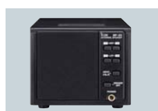
SP-23 EXTERNAL SPEAKER 4 audio filters; headphone jack. Input impedance: 8Ω. Max. input power: 5W (Not available for EU countries)