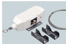
MN-100L ANTENNA MATCHER Match the transceiver to a long-wire antenna without applying DC power. 15 m×1 antenna wire comes attached.