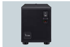
PS-125 DC POWER SUPPLY Compact power supply with high current capability. Output: 13.8 V DC (25 A max.)