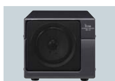
SP-21 EXTERNAL SPEAKER Input impedance: 8Ω. Max. input power: 5W