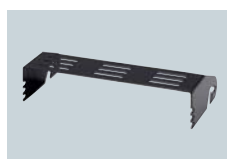
IC-MB5 MOBILE BRACKET For installing the transceiver under a table, in a vehicle, etc.