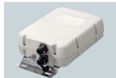
AH-4 AUTOMATIC ANTENNA TUNER Covers 3.5–30 MHz with a 7 m (23 ft) or longer wire antenna.