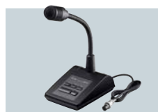
SM-50 DESKTOP MICROPHONE Dynamic microphone. Includes [UP]/[DOWN] switches and low cut function.