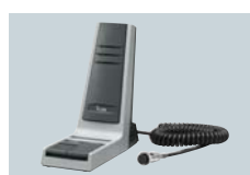
SM-27 DESKTOP MICROPHONE Dynamic microphone with PTT lock switch.