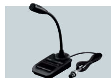
SM-30 DESKTOP MICROPHONE Compact, lightweight electret microphone. SM-20 is also available.