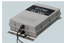
AT-140 HF AUTOMATIC ANTENNA TUNER Covers 1.6–30 MHz with a 7 m (23 ft) or longer wire antenna. AT-130/E is also available.