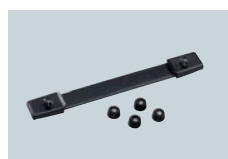
MB-23 CARRYING HANDLE For easy portability.