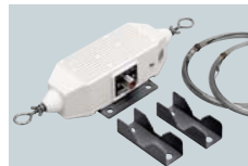
MN-100 ANTENNA MATCHER Match the transceiver to a dipole antenna without applying DC power. 8 m×2 antenna wires come attached.